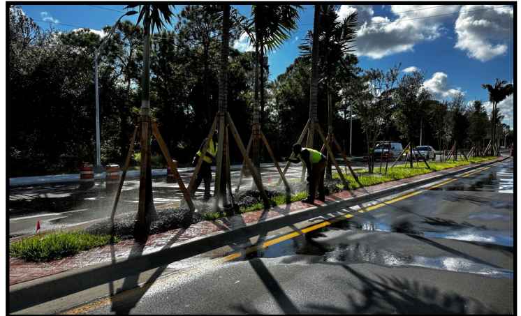
Continued irrigation work in the median